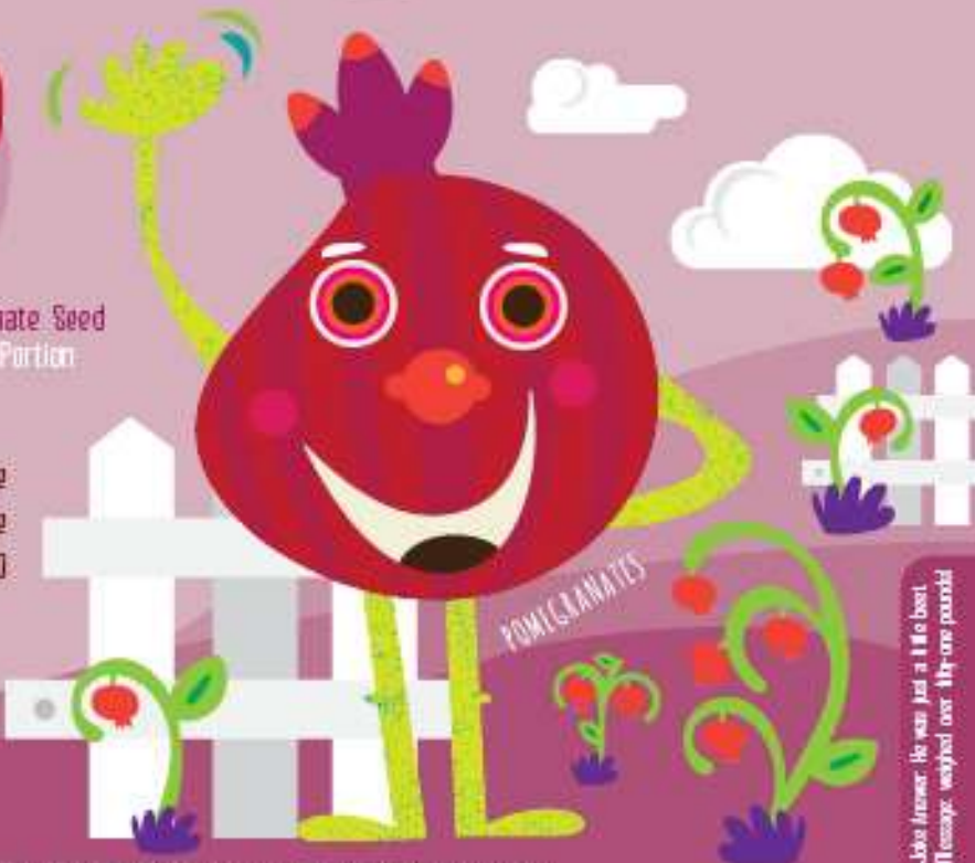
Joke answer: He was just a little beet. If message, weighed over 145 one pound!